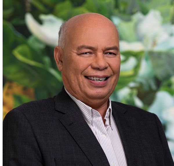
Sir Collin Tukuitonga KNZM FNZCPHM