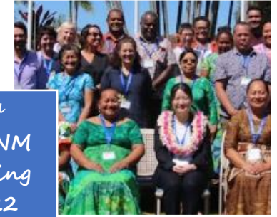
3 rd PHONM meeting 2022