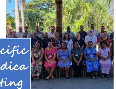
5 th Pacific Biomedical Meeting