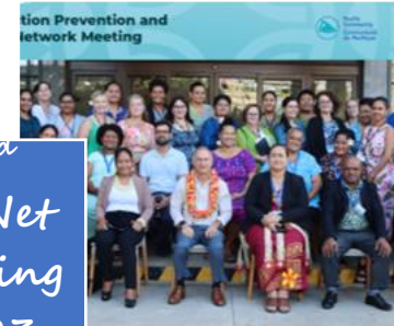
2 nd PICNet Meeting 2023