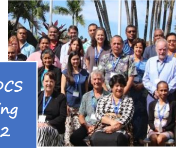
13 th DCS meeting 2022