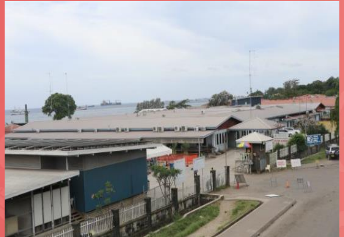
NATIONAL REFERRAL HOSPITAL